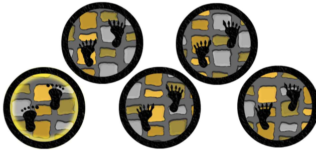
Party and Encounter tokens